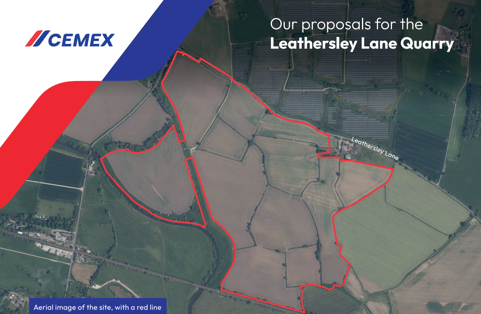
Aerial image of the site, with a red line

Cemex is proposing a new sand and gravel quarry development at Leathersley Lane, Sudbury, Derbyshire. This project aims to extract around 2.1 million tonnes of sand and gravel to support regional construction needs. The site, chosen for its rich deposits, will be designed to minimise disruption, using an upgraded farm access and ensuring safe, efficient transportation to and from the site.